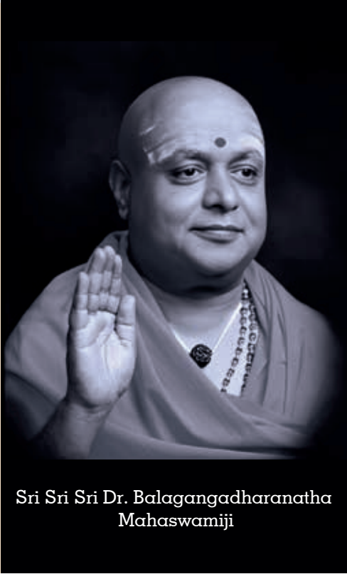
Sri Sri Sri Dr. Balagangadharanatha Mahaswamiji

Advance health care through excellence in nursing and interdisciplinary teaching, research, practice and service